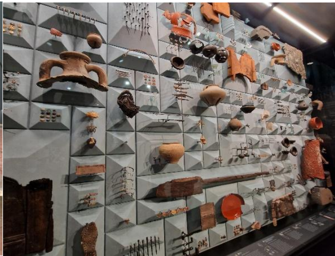
The Temple of Mithras